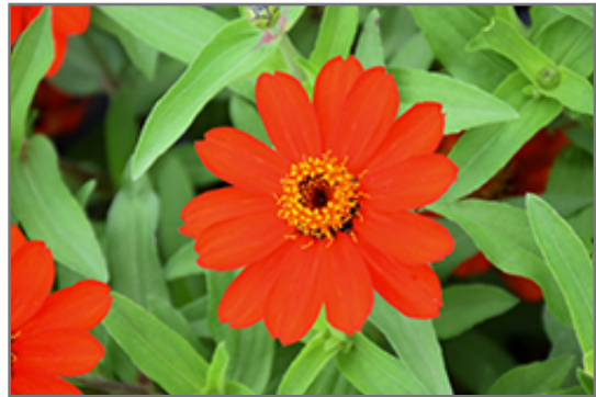
Zahara XL Fire Zinnia flowers