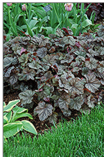
Pewter Veil Coral Bells