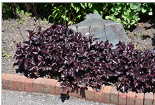
Obsidian Coral Bells