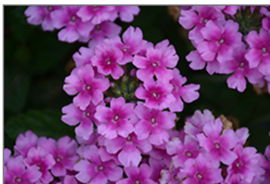
EnduraScape Pink Bicolor Verbena flowers

EnduraScape Pink Bicolor Verbena is recommended for the following landscape applications;