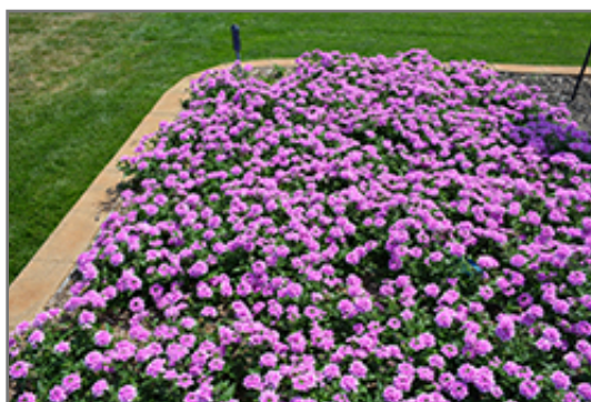
EnduraScape Pink Bicolor Verbena in bloom