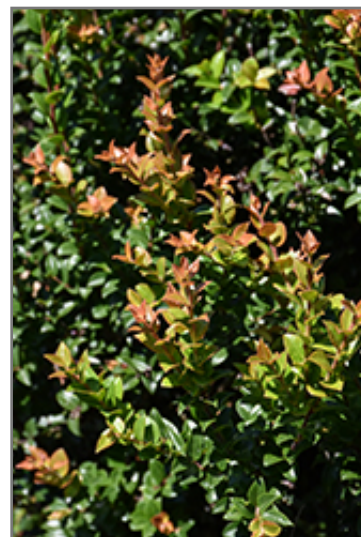
Thunderbird Evergreen Huckleberry foliage

Thunderbird Evergreen Huckleberry makes a fine choice for the outdoor landscape, but it is also well-suited for use in outdoor pots and containers. With its upright habit of growth, it is best suited for use as a 'thriller' in the 'spiller-thriller-filler' container combination; plant it near the center of the pot, surrounded by smaller plants and those that spill over the edges. It is even sizeable enough that it can be grown alone in a suitable container. Note that when grown in a container, it may not perform exactly as indicated on the tag - this is to be expected. Also note that when growing plants in outdoor containers and baskets, they may require more frequent waterings than they would in the yard or garden.