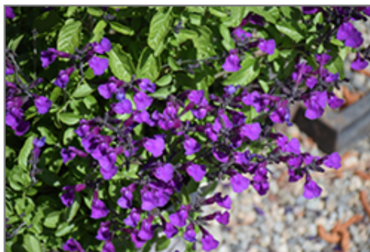
Vibe Ignition Purple Sage flowers

Vibe Ignition Purple Sage will grow to be about 18 inches tall at maturity extending to 24 inches tall with the flowers, with a spread of 18 inches. When grown in masses or used as a bedding plant, individual plants should be spaced approximately 15 inches apart. It grows at a medium rate, and under ideal conditions can be expected to live for approximately 5 years. As an evergreen perennial, this plant will typically keep its form and foliage year-round.