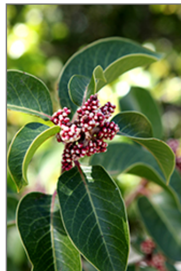
Sugar Bush flower buds

Sugar Bush is recommended for the following landscape applications;