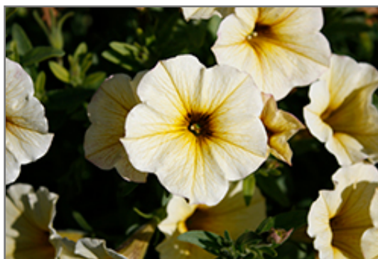
SuperCal Light Yellow Petchoa flowers