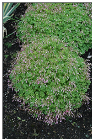
Pink Sorrel in bloom