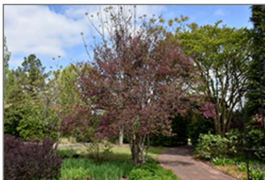
Zhuzhou Fuchsia Chinese Fringeflower in bloom