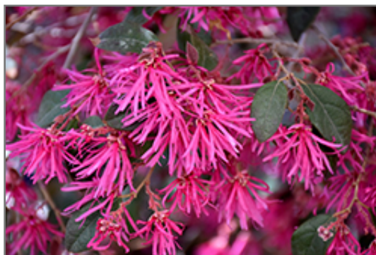
Zhuzhou Fuchsia Chinese Fringeflower flowers

Zhuzhou Fuchsia Chinese Fringeflower is recommended for the following landscape applications;