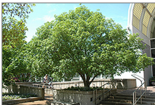
Purpleblow Maple

Purpleblow Maple will grow to be about 20 feet tall at maturity, with a spread of 15 feet. It has a low canopy with a typical clearance of 4 feet from the ground, and is suitable for planting under power lines. It grows at a slow rate, and under ideal conditions can be expected to live for 70 years or more.