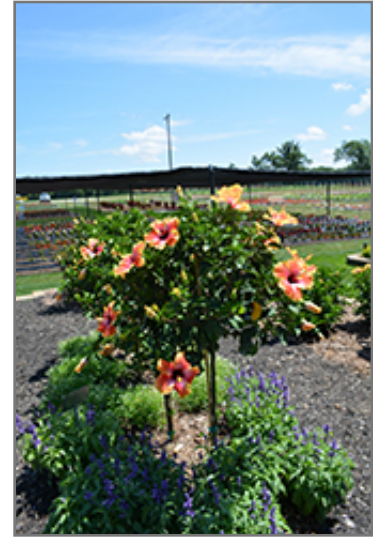
Fiesta Hibiscus (topiary form)

Fiesta Hibiscus is a fine choice for the garden, but it is also a good selection for planting in outdoor pots and containers. With its upright habit of growth, it is best suited for use as a 'thriller' in the 'spiller-thriller-filler' container combination; plant it near the center of the pot, surrounded by smaller plants and those that spill over the edges. It is even sizeable enough that it can be grown alone in a suitable container. Note that when growing plants in outdoor containers and baskets, they may require more frequent waterings than they would in the yard or garden.