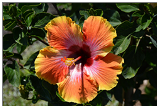
Fiesta Hibiscus flowers

This plant is native to the tropics and prefers growing in moist environments with evenly warm conditions all year round. In our climate, it is usually grown as an outdoor annual in the garden or in a container. If you want it to survive the winter, it can be brought in to the house and provided with special care, and then returned to the garden the following season. In its preferred tropical habitat, it can grow to be around 8 feet tall at maturity, with a spread of 6 feet. However, when grown as an annual or when overwintered indoors, it can be expected to perform differently, and its exact height and spread will depend on many factors; you may wish to consult with our experts as to how it might perform in your specific application and growing conditions.