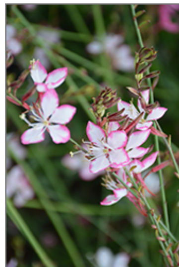
Rosy Jane Gaura flowers