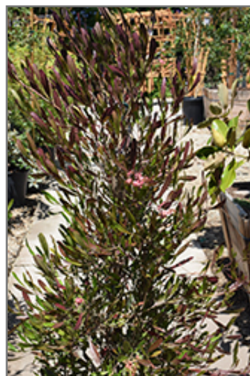
Purple Hop Bush