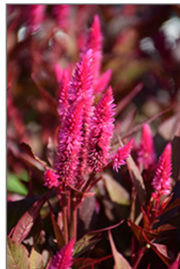
Kelos Atomic Neon Pink Celosia flowers

Kelos Atomic Neon Pink Celosia is recommended for the following landscape applications;