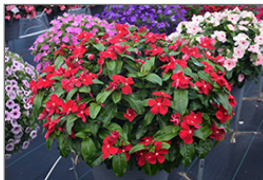
Titan Really Red Vinca in bloom