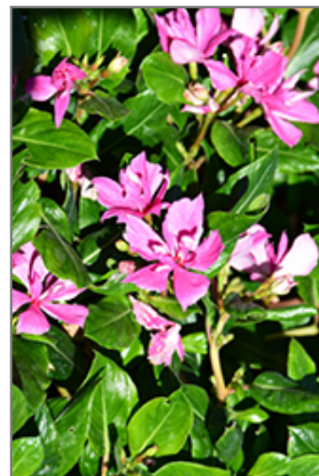
Soiree Kawaii Double Pink Vinca flowers

Soiree Kawaii Double Pink Vinca is recommended for the following landscape applications;