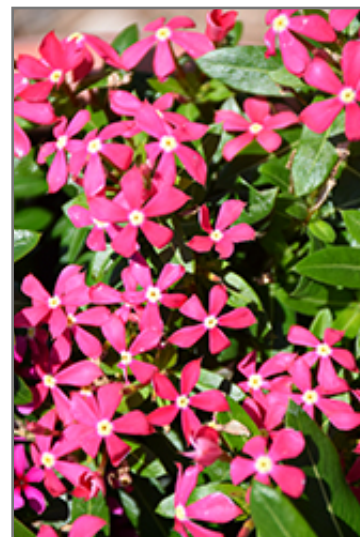
Soiree Kawaii Coral Vinca flowers

Soiree Kawaii Coral Vinca is recommended for the following landscape applications;