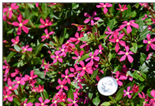
Soiree Kawaii Coral Vinca flowers