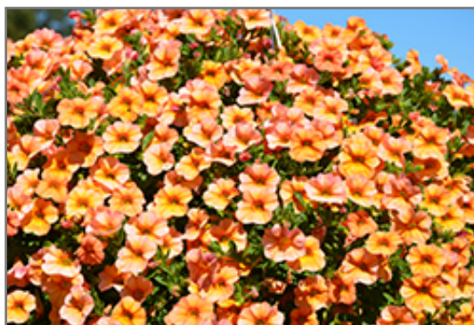
Noa Peach Calibrachoa flowers