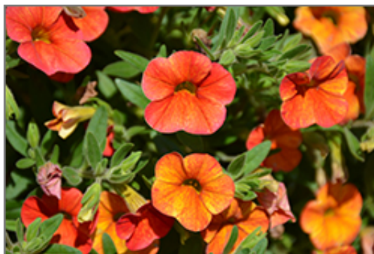
Callie Orange Sunrise Calibrachoa flowers

Callie Orange Sunrise Calibrachoa is recommended for the following landscape applications;