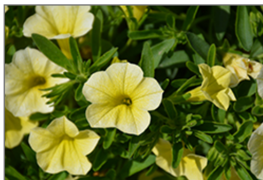
Cabaret Lemon Yellow Calibrachoa flowers