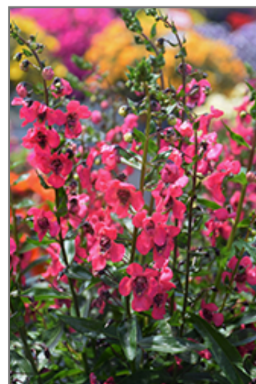
Archangel Cherry Red Angelonia flowers

Archangel Cherry Red Angelonia is a fine choice for the garden, but it is also a good selection for planting in outdoor containers and hanging baskets. It is often used as a 'filler' in the 'spiller-thriller-filler' container combination, providing a mass of flowers against which the larger thriller plants stand out. Note that when growing plants in outdoor containers and baskets, they may require more frequent waterings than they would in the yard or garden.