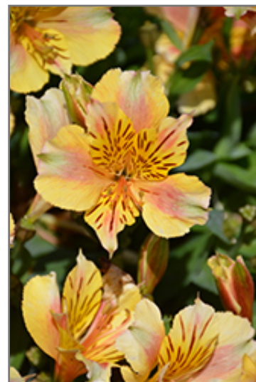
Colorita Sara Alstroemeria flowers