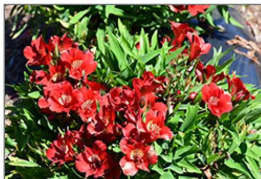
Colorita Kate Alstroemeria in bloom