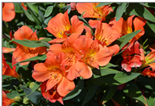
Colorita Amina Alstroemeria flowers