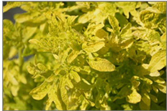
Under The Sea Yellowfin Tuna Coleus foliage

Under The Sea Yellowfin Tuna Coleus is recommended for the following landscape applications;