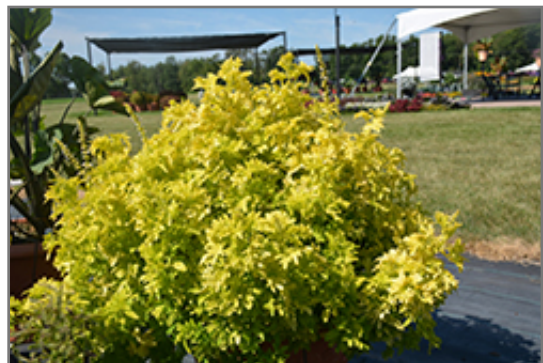
Under The Sea Yellowfin Tuna Coleus