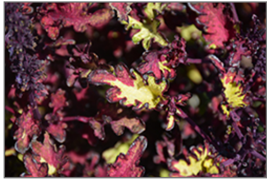
Under the Sea Sea Monkey Rust Coleus foliage