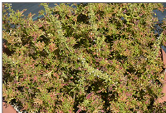
Under The Sea Red Coral Coleus foliage

Under The Sea Red Coral Coleus will grow to be about 20 inches tall at maturity, with a spread of 24 inches. When grown in masses or used as a bedding plant, individual plants should be spaced approximately 20 inches apart. Although it's not a true annual, this fast-growing plant can be expected to behave as an annual in our climate if left outdoors over the winter, usually needing replacement the following year. As such, gardeners should take into consideration that it will perform differently than it would in its native habitat.