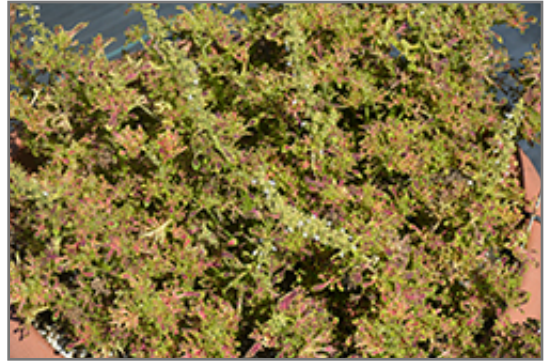
Under The Sea Red Coral Coleus foliage

Under The Sea Red Coral Coleus will grow to be about 20 inches tall at maturity, with a spread of 24 inches. When grown in masses or used as a bedding plant, individual plants should be spaced approximately 20 inches apart. Although it's not a true annual, this fast-growing plant can be expected to behave as an annual in our climate if left outdoors over the winter, usually needing replacement the following year. As such, gardeners should take into consideration that it will perform differently than it would in its native habitat.