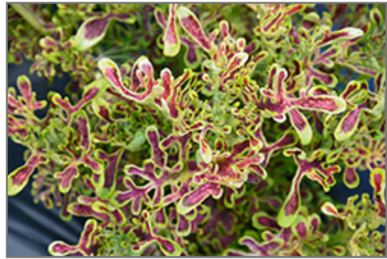
Under The Sea Red Coral Coleus foliage

Under The Sea Red Coral Coleus is recommended for the following landscape applications;