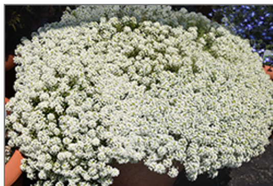
Snow Globe Alyssum in bloom