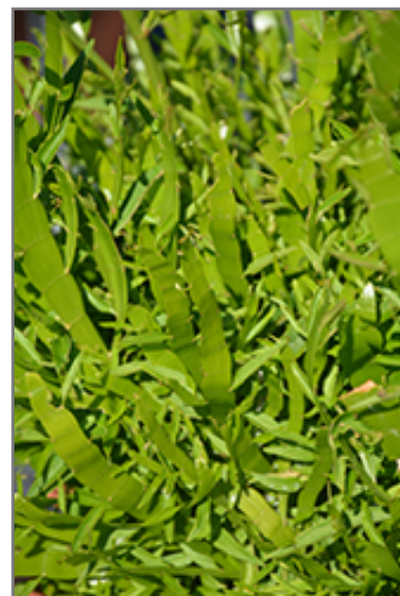
Ribbons and Curls Ribbon Bush foliage