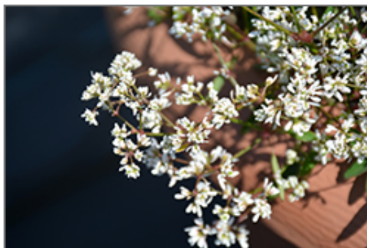
Bling White Princess Euphorbia flowers

Bling White Princess Euphorbia will grow to be about 12 inches tall at maturity, with a spread of 24 inches. Its foliage tends to remain dense right to the ground, not requiring facer plants in front. This fast-growing annual will normally live for one full growing season, needing replacement the following year.