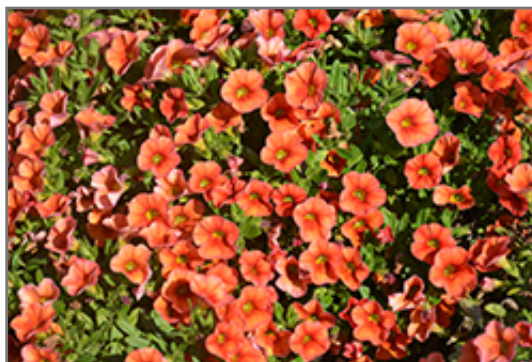
Catwalk Mandarin Glow Calibrachoa flowers

Catwalk Mandarin Glow Calibrachoa is a fine choice for the garden, but it is also a good selection for planting in outdoor containers and hanging baskets. Because of its trailing habit of growth, it is ideally suited for use as a 'spiller' in the 'spiller-thriller-filler' container combination; plant it near the edges where it can spill gracefully over the pot. Note that when growing plants in outdoor containers and baskets, they may require more frequent waterings than they would in the yard or garden.