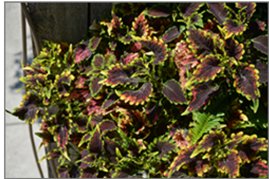
Sky Fire Coleus foliage