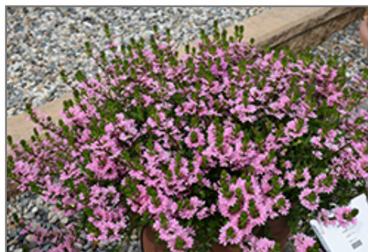
Whirlwind Pink Fan Flower in bloom