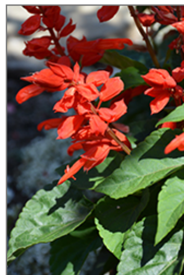
Ablazin' Tabasco Sage flowers