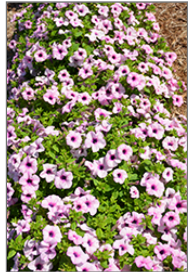
Surfinia Sumo Glacial Pink Petunia in bloom

Surfinia Sumo Glacial Pink Petunia is a fine choice for the garden, but it is also a good selection for planting in outdoor containers and hanging baskets. Because of its trailing habit of growth, it is ideally suited for use as a 'spiller' in the 'spiller-thriller-filler' container combination; plant it near the edges where it can spill gracefully over the pot. Note that when growing plants in outdoor containers and baskets, they may require more frequent waterings than they would in the yard or garden.