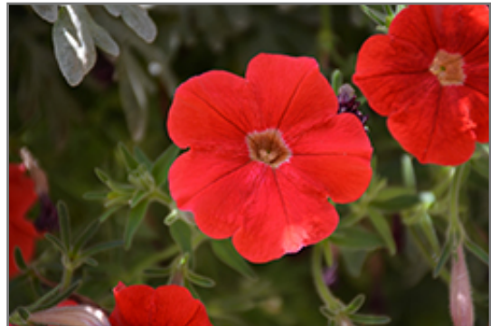
Supertunia Really Red Petunia flowers

Supertunia Really Red Petunia is recommended for the following landscape applications;