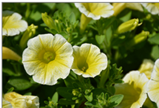
Blanket Yellow Petunia flowers