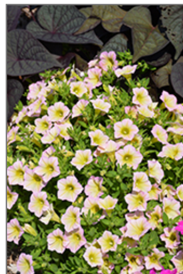
Blanket Lemon Glow Petunia in bloom