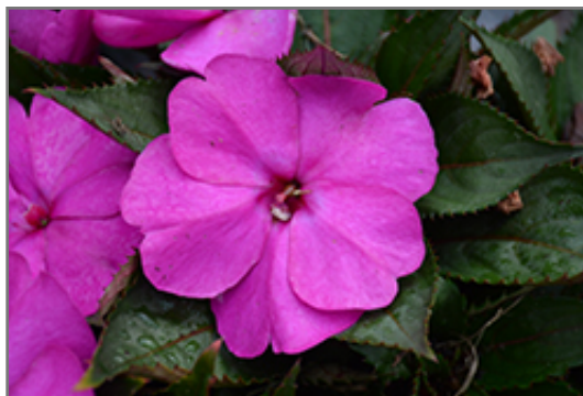
SunPatiens Compact Purple New Guinea Impatiens flowers

SunPatiens Compact Purple New Guinea Impatiens is recommended for the following landscape applications;