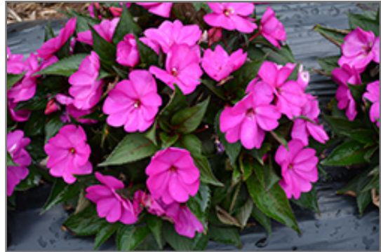
SunPatiens Compact Purple New Guinea Impatiens in bloom

SunPatiens Compact Purple New Guinea Impatiens will grow to be about 24 inches tall at maturity, with a spread of 24 inches. When grown in masses or used as a bedding plant, individual plants should be spaced approximately 20 inches apart. Its foliage tends to remain dense right to the ground, not requiring facer plants in front. This fast-growing annual will normally live for one full growing season, needing replacement the following year.