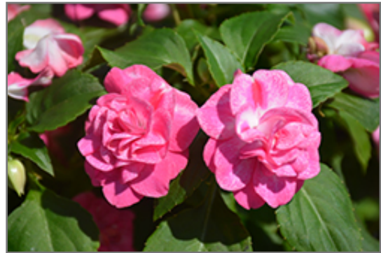
Rockapulco Rose Impatiens flowers