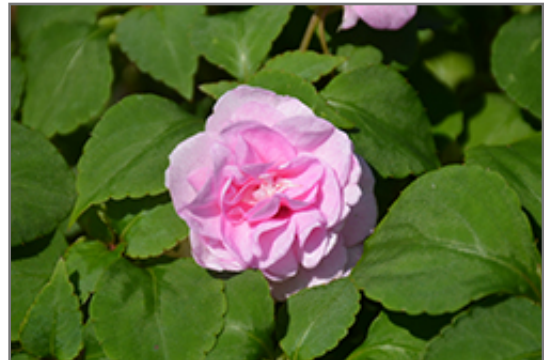
Rockapulco Orchid Impatiens flowers