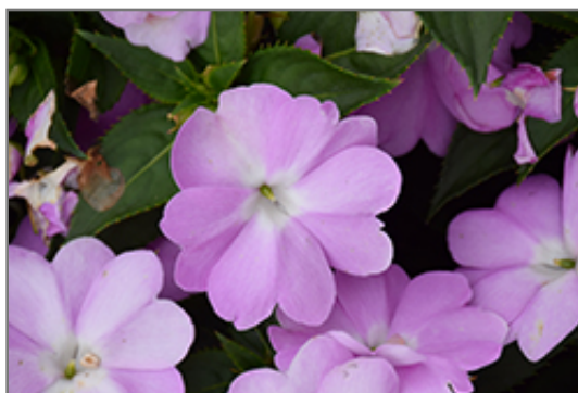
Infinity Lavender New Guinea Impatiens flowers