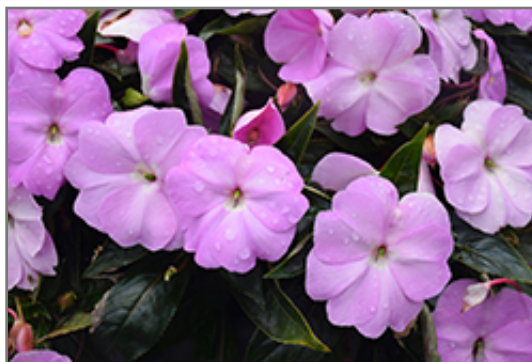
Infinity Lavender New Guinea Impatiens flowers

Infinity Lavender New Guinea Impatiens is recommended for the following landscape applications;