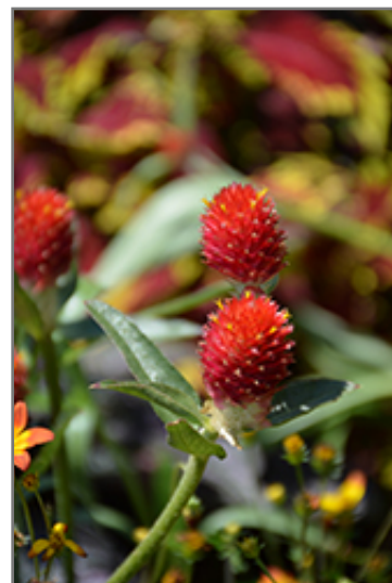
Forest Red Globe Amaranth flowers