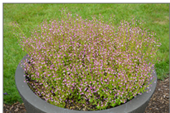
Fairy Dust Pink Cuphea in bloom