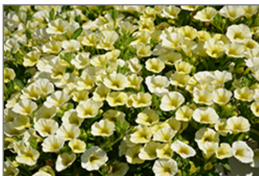
Superbells Over Easy Calibrachoa flowers