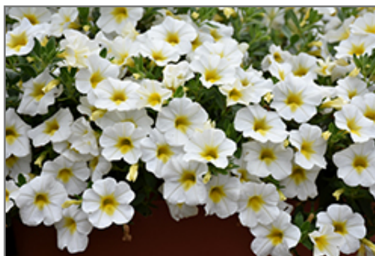
Superbells Over Easy Calibrachoa flowers