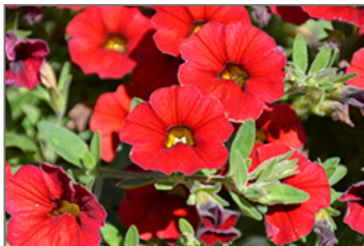
Million Bells Mounding Compact Deep Red Calibrachoa flowers

Million Bells Mounding Compact Deep Red Calibrachoa is recommended for the following landscape applications;