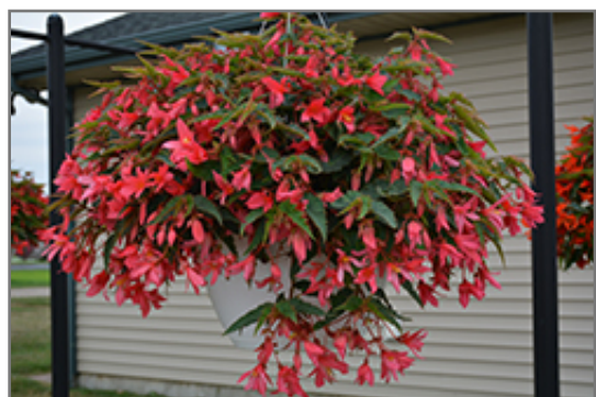
Bossa Nova Pink Glow Begonia in bloom