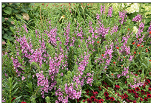
Angelface Super Pink Angelonia in bloom

Angelface Super Pink Angelonia is a fine choice for the garden, but it is also a good selection for planting in outdoor containers and hanging baskets. With its upright habit of growth, it is best suited for use as a 'thriller' in the 'spiller-thriller-filler' container combination; plant it near the center of the pot, surrounded by smaller plants and those that spill over the edges. Note that when growing plants in outdoor containers and baskets, they may require more frequent waterings than they would in the yard or garden.