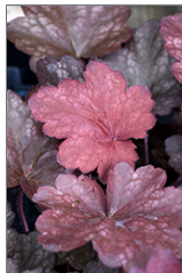
Carnival Candy Apple Coral Bells foliage